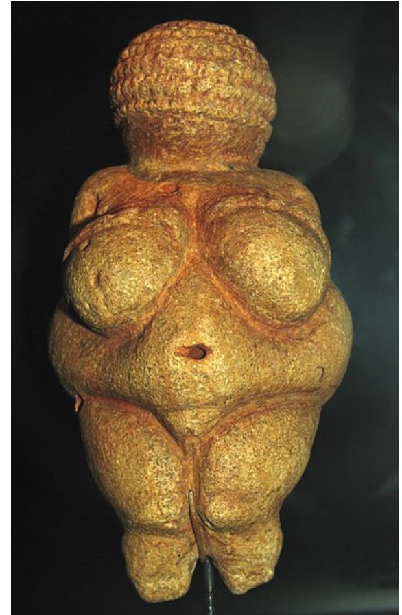
Venus from Willendorf [10].

Venus from Willendorf is estimated to have been made 30,000 years ago.