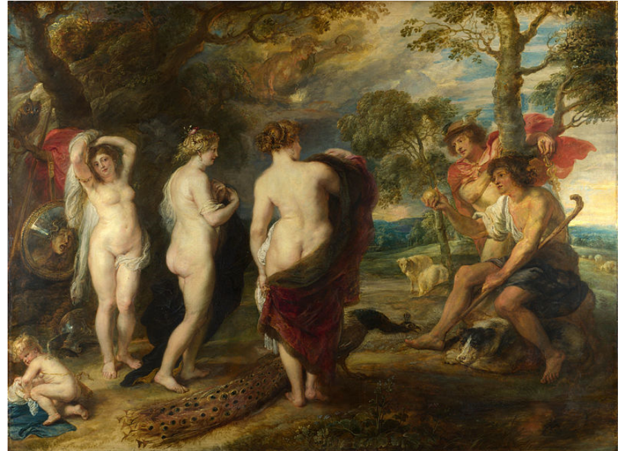
The Judgement of Paris (1636), painted by Peter Paul Rubens [7] .

Aphrodite win over by promising Paris the most beautiful women on earth.