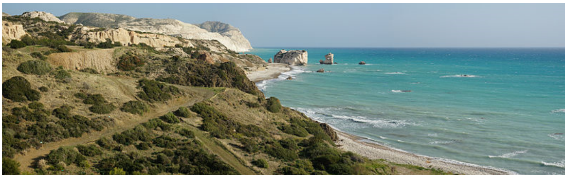
Coast near Paphos [4].