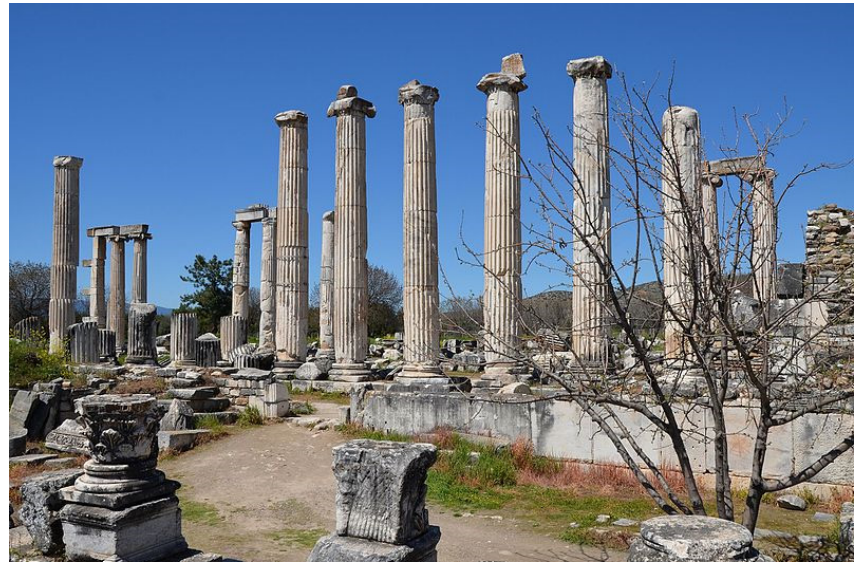
Temple ruins at Aphrodisias [8].

For Aphrodisia the temple was purified with the blood of a dove.