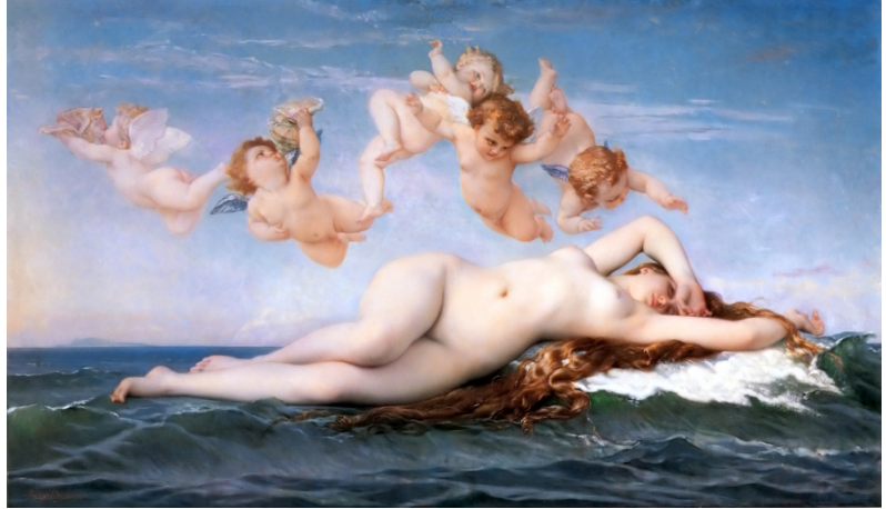
The Birth of Venus (1863), painted by Alexandre Cabanel [3].

Through Uranus sperm and blood the Ocean generated the foam from which Aphrodite emerged.