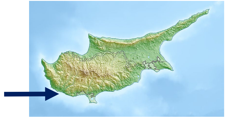
Paphos on the island of Cyprus [5].

Aphrodite was born in the ocean near by Phaphos on the island of Cyprus.