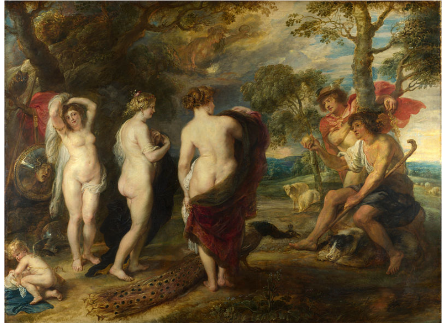
The Judgement of Paris (1636), painted by Peter Paul Rubens [7] .

Paris took Helen and started the Trojan War.