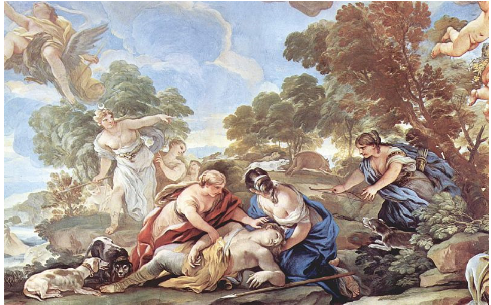
Death of Adonis (1684-1686), painted by Luca Giordano [6].

Adonis was killed by Ares who was masked as wild boar.